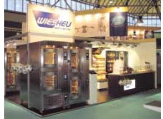
Bakkerij Dagen, Amsterdam