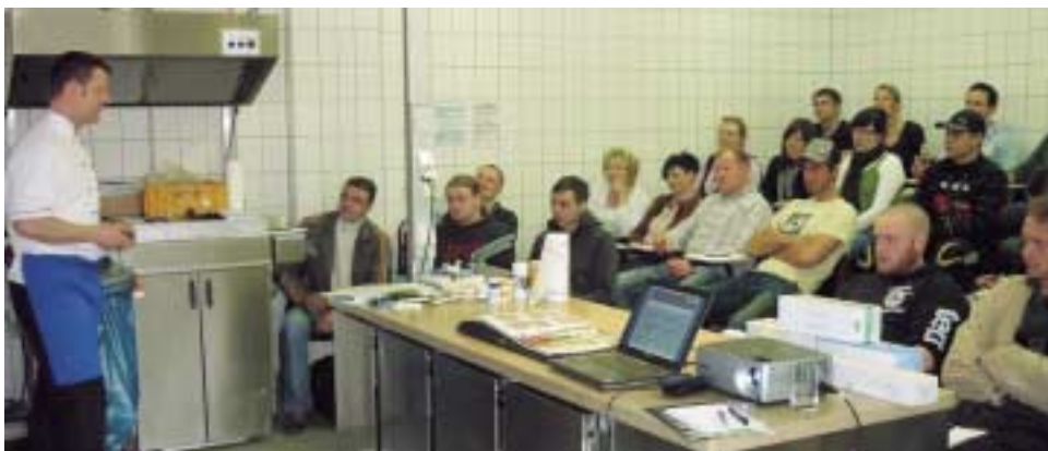
Seminar in Bergholz-Rehbrücke