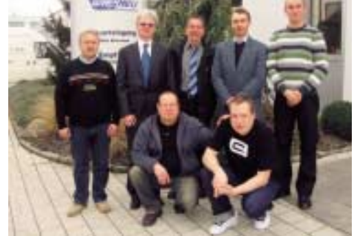
Technician training course, Poland