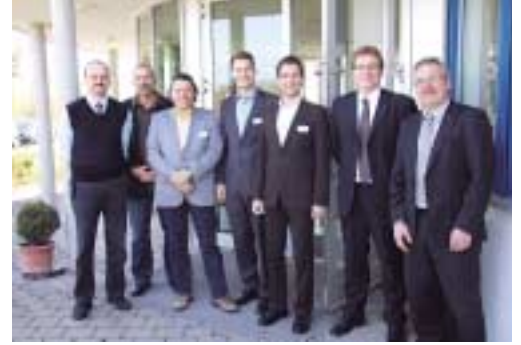
Spar Austria visit