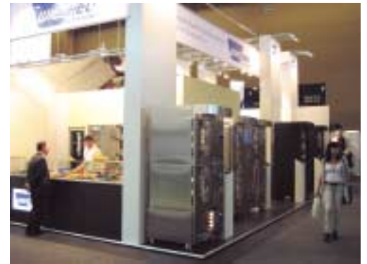
die Genuss, Wels

in Austria, used the opportunity to show his customers all of the product innovations in their own country.