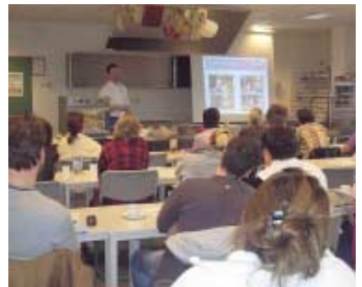
Snack seminar for master bakers, apprentices and sales staff at Berufl. Schule Elmshorn (Elmshorn Vocational School)