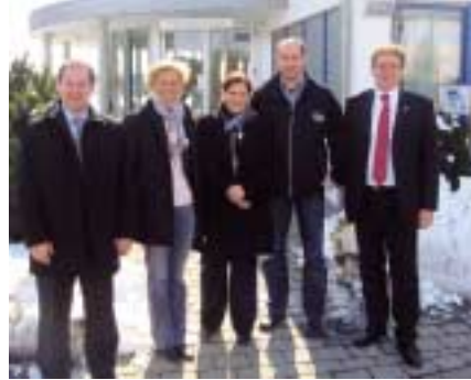
REWE Group Austria visit