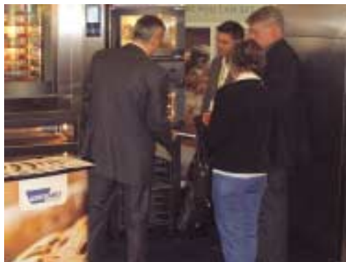
Nordic Bakery. Many representatives from retail food shops came to the WIESHEU stand and were very excited about what the baking ovens could do.