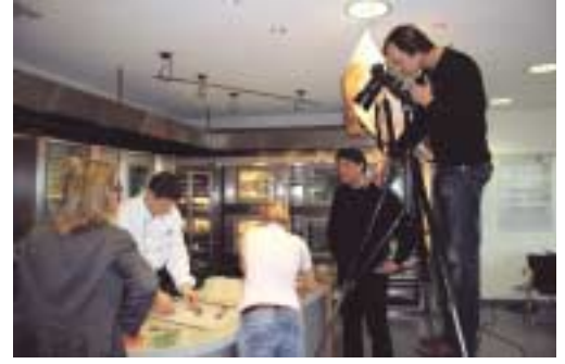
The photographer in action

For anyone who is interested, the snack book is in the shops now. The book was published by Matthaes Verlag in Stuttgart.