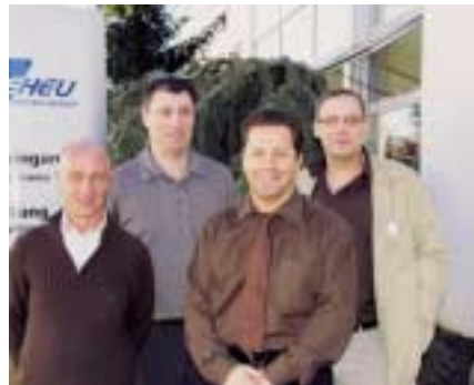
Training course for service partners in France