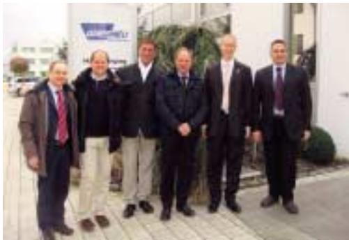
Aspiag Bizerba visit