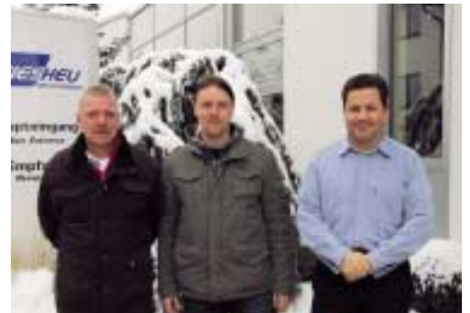
Dallmeyers Backhus training course