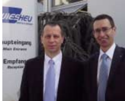
Hiestand Poland visit