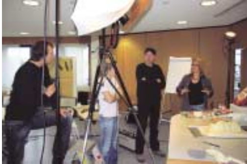
Discussion about photos

To start off with it was just a vision, an idea, and then it became reality.